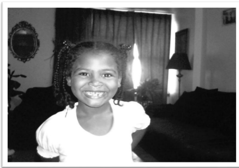
Figure 4.3. Photograph of Granddaughter

Social interaction lifts me up. Additional facilitators to engaging in self-care