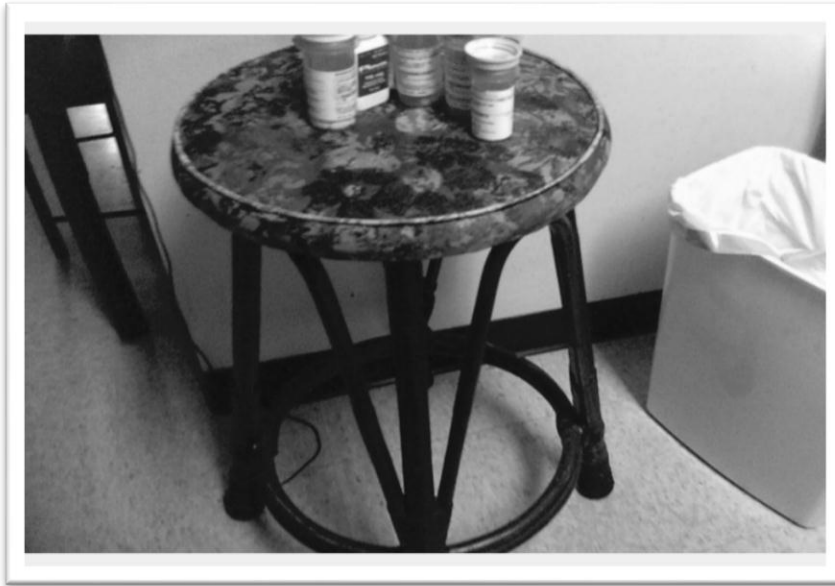
Figure 4.1. Photograph of Medications

Dietary restrictions. Each participant reported following a healthy diet.